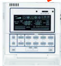
Smart Zone Controller